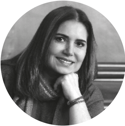
TANIA LIBERTAD Peru/México

Born in Peru, where she started her artistic career at the age of seven; at the age of nine she records her first record, and at the age of eleven, she positions herself as one of the most important interpreters of Peruvian music. Later on she decides to tackle Latin American music, thus becoming one of the better ones in her gender, what brings her to perform in Mexico, where she decides to take residence since 1980. Thanks to her cultural work, she also becomes one of the most beloved and recognized artists of this country from where she built the platform of her internationalization. Her discography includes 45 albums which have sold more than ten million copies, which resulted in her earning multiple gold and platinum records. She has appeared in the most important stages in the world, among which stands out; the Olympia in Paris, the Royal Concertgebouw in Amsterdam, Carnegie Hall in New York, the Sidney Opera House and the Palace of Fine Arts in Mexico among others.